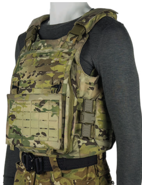
Advanced Magnetic buckles