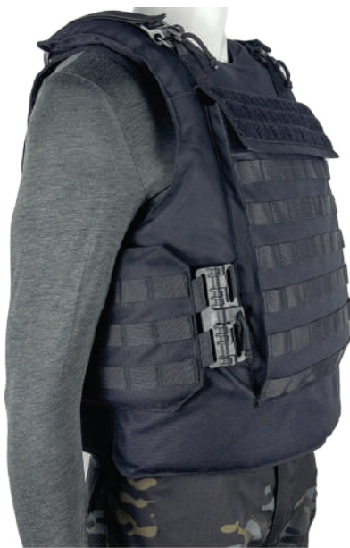
QR Plastic buckles

This vest is designed for units that need to rapidly adjust the level of protection based on the threat and mission requirements. It features a MOLLE system around the vest for attaching magazines, grenades, radios, and other equipment. The vest includes external pockets with zippers for inserting plates in the front and back and side plates can be easily attached within seconds. Quick-Release or Advanced Magnetic buckles on the sides and shoulders enhances ease of use.